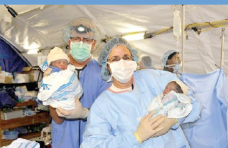
HAITI EARTHQUAKE - 2010

ALTERNATE EOC VICTIM SERVICES TRIAGE ISOLATION IMMUNIZATION ER/OR/ICU BURN UNIT MORTUARY