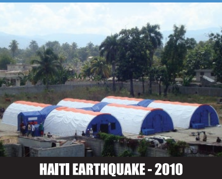
HAITI EARTHQUAKE - 2010