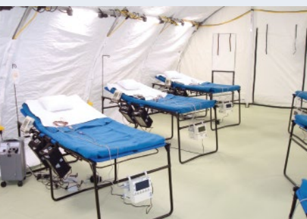
KENYA-SOMALIA BORDER - 2011

For more information or immediate response, contact: