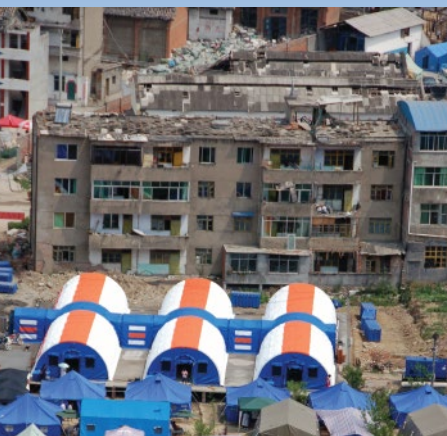
CHINA EARTHQUAKE - 2008