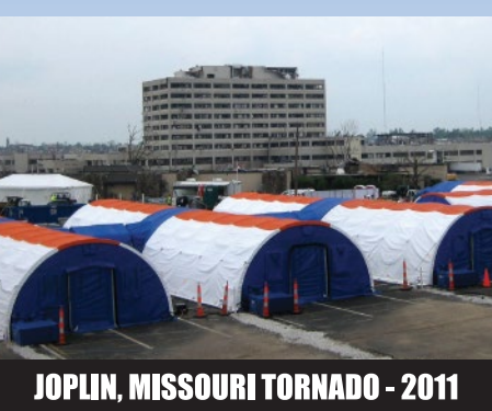
JOPLIN, MISSOURI TORNADO - 2011