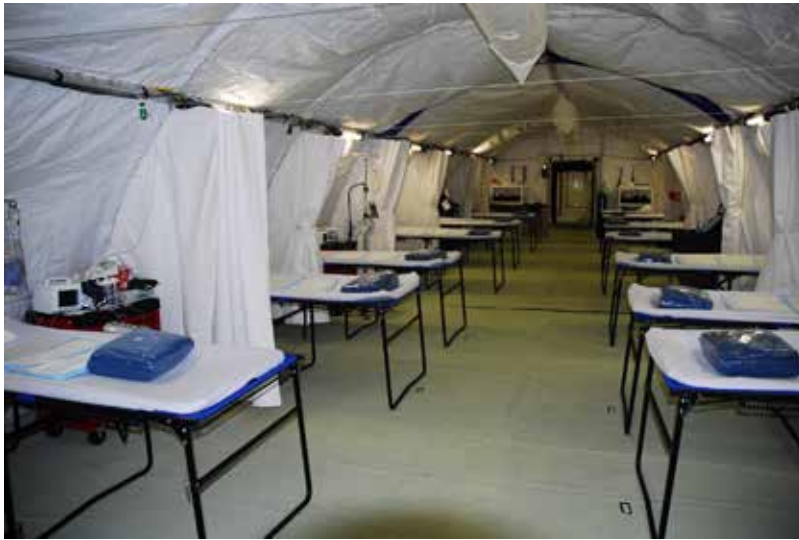
Patient ward equipped with adjustable BLU-MED® Beds